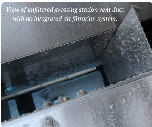
View of unfiltered grossing station vent duct with no integrated air filtration system.

The Maestro Encore Integrated Air Filtration System sets new safety standards for grossing stations. This system protects Pathologists' Assistants from dangerous formalin exposure by helping to ensure consistent airflow throughout the grossing station. By preventing the accumulation of dust and debris within the unit, filters enhance user safety and allow the backdraft and patented SafeDraft™ Ventilation Technology to perform at its optimal level.