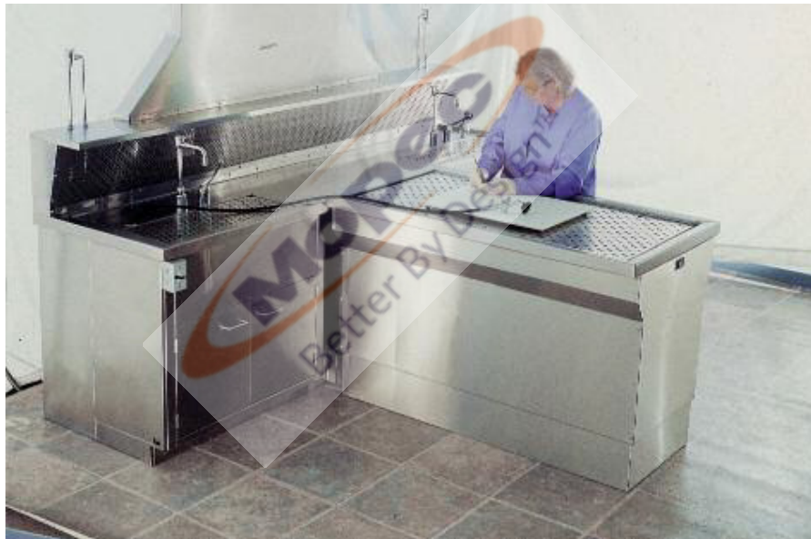
HK100 Elevating Wing Totaldraft Station - (HK100 includes HK200 and HK300)